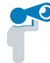
Figure 1. Core components of good strategic planning.

looks to the future to ensure changes address future need and challenges to stay ahead of long-term.